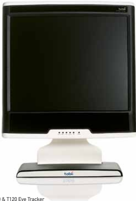
Tobii T60 & T120 Eye Tracker

Tobii eye trackers are easy to use, fully automatic, and can track basically everyone, without any restrictions on the test participant or the slightest compromise in tracking quality.