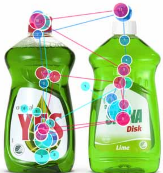
Gaze plots based on data from three test participants looking at product packaging.

Differentiate your services and extend your research portfolio. Backup your recommendations with evidence from the real world and use striking reports, visualizations and video clips.