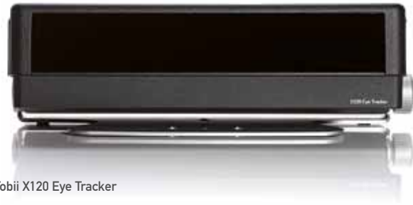
Tobii X120 Eye Tracker

The Tobii T60 and T120 Eye Trackers are integrated into a 17" TFT monitor. They are ideal for all forms of eye tracking studies with stimuli that can be presented on a screen. Other screen sizes are also available. The eye trackers come with an integrated web camera to unobtrusively record user behavior.