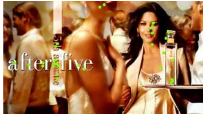
Bee swarm based on data from multiple test participants viewing a TV commercial.

You know when people channel surf and you know what program or commercial they were watching. But did you know exactly what they were looking at directly prior to changing the channel? Did they pay attention? Was your message communicated?