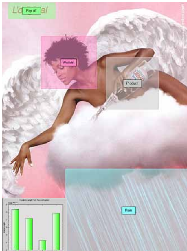
A print ad divided into Areas of Interests, for which the gaze time is calculated. Guesswork is replaced by fact.

Pre-test and analyze print advertising, OOH, DM and other visual advertising. Test the communication concept and visualize awareness and attention. Tobii Studio allows you to do quantitative studies of how communication is perceived and in which order consumers view the information.