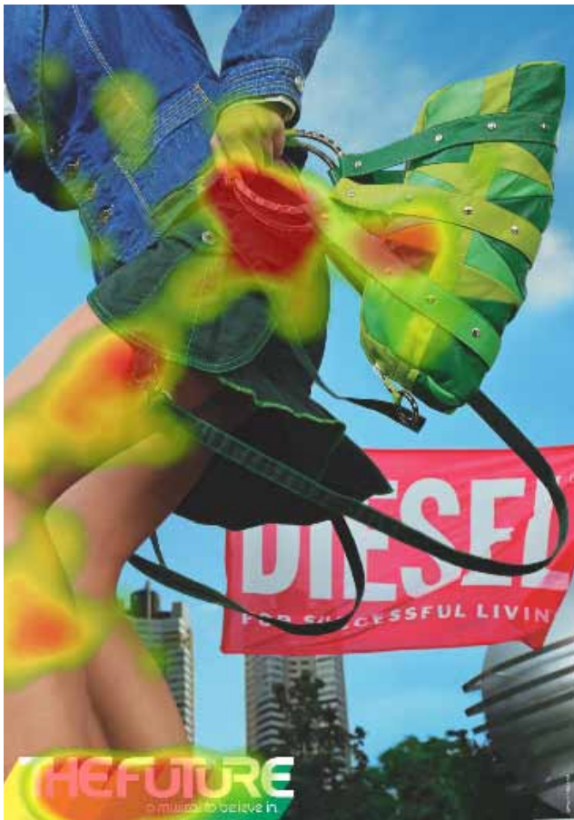
Heat map based on data from multiple test participants looking at a print ad.

The average time spent looking at a print ad is less than two seconds. The decision to engage or turn the page is made within this short time. The reasons for this become clear when you see what respondents see.